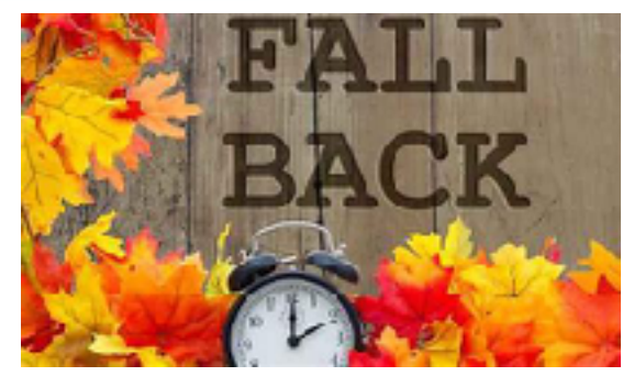
November 7, 2021